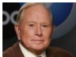
Eyewitness News Team

Come on Tuesday and enjoy the traditional flamenco show. A very lively and enthusiastic group of performers and there's no cover or minimum. Just come in and enjoy.